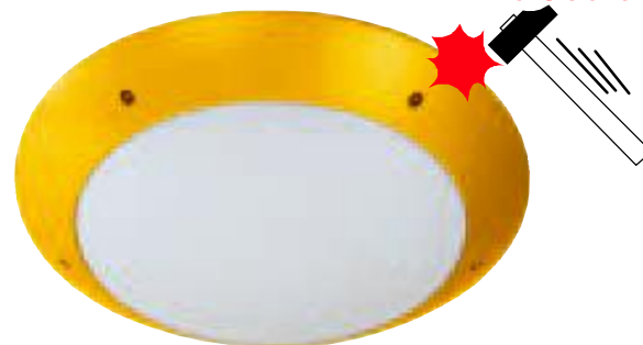
Luminaire ROSTOCK Colour finish according to RAL (additional charge).