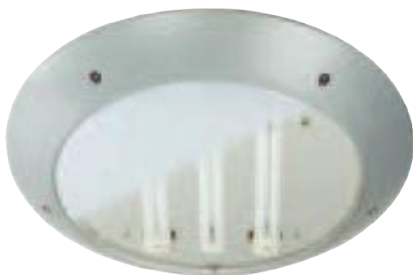
ROSTOCK , vandalism-resistant luminaire for 3 x TC-L 24 W. Available with different circuit set-up.