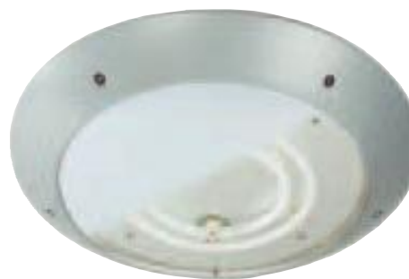
ROSTOCK , vandalism-resistant luminaire for circline lamps FC-55 W and 22 W.