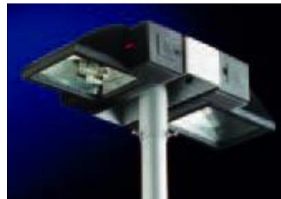
Bracket for pole mounting for 1 up to 4 luminaires