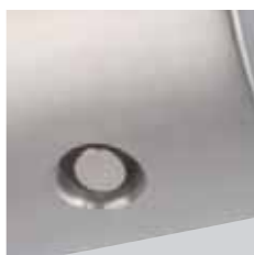
Oval sealing screw prevents unauthorised opening