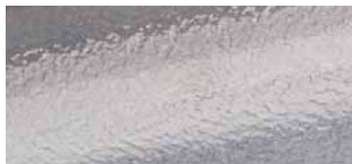
High impact-resistant structured PC lamp diffuser